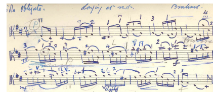
A piece from the Lionel Tertis collection

Trinity Laban's Faculty of Music played a crucial role in the development of Tertis' career. He studied piano, harmony and violin on an ad hoc basis between 1892 and 1894 at the then Trinity College of Music. In 1962, he spoke of the 'benefit