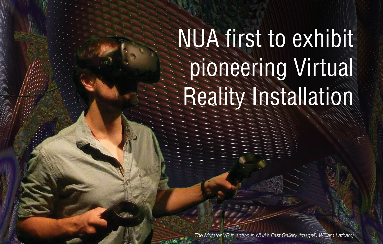
The Mutator VR in action in NUA's East Gallery (image© William Latham)

The East Gallery at NUA has exhibited the Mutator VR, a new installation that blends art, maths and software development.