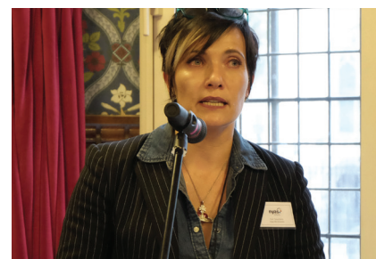
Edge Hill Chancellor Professor Tanya Byron

High Court of England and Wales. Speaking at the launch, Chancellor Professor Tanya Byron said; “There is a digital generation divide and I'm very proud that Edge Hill is able to help NYAS by creating solutions to digital problems in the hope of reaching thousands more vulnerable young people.”